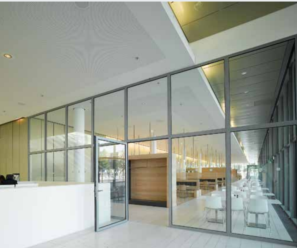
Fire-rated and smoke-tight door assemblies