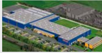
Hörmann KG Antriebstechnik, Germany