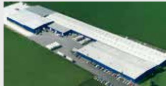
Hörmann LLC, Montgomery IL, USA