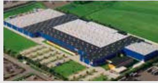
Hörmann KG Brandis, Germany