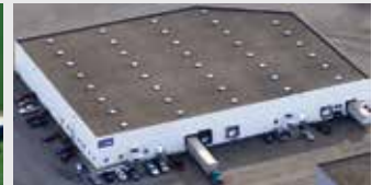
Hörmann Flexon, Leetsdale PA, USA

Hörmann is the only manufacturer worldwide that offers you a complete range of all major building products from one source. We manufacture in highly-specialised factories using the latest production technologies. The close-meshed network of sales and service companies throughout Europe, and activities in the USA and China, make Hörmann your strong partner for first-class building products, offering “Quality without Compromise”.