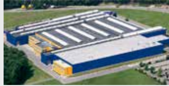
Hörmann KG Eckelhausen, Germany