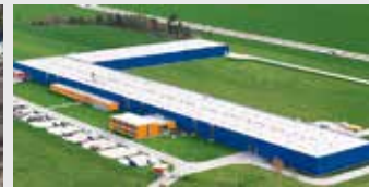
Hörmann Legnica Sp. z o.o., Poland