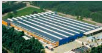
Hörmann Genk NV, Belgium