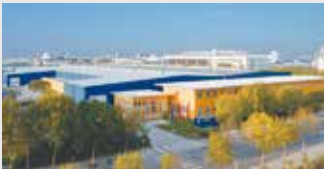
Hörmann Beijing, China