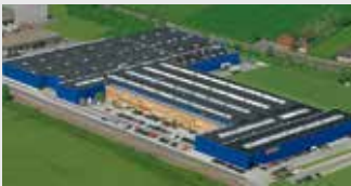
Hörmann KG Werne, Germany