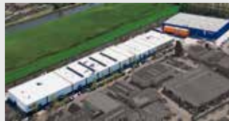
Hörmann Alkmaar B.V., Netherlands