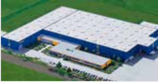
Hörmann KG Dissen, Germany