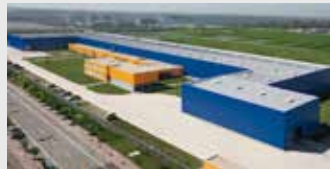
Hörmann Tianjin, China