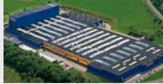
Hörmann KG Freisen, Germany