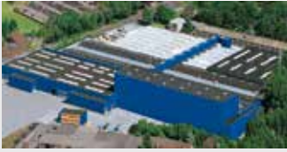
Hörmann KG Amshausen, Germany