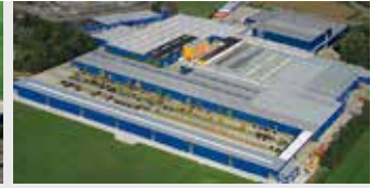
Hörmann KG Brockhagen, Germany