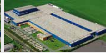
Hörmann KG Ichttershausen, Germany